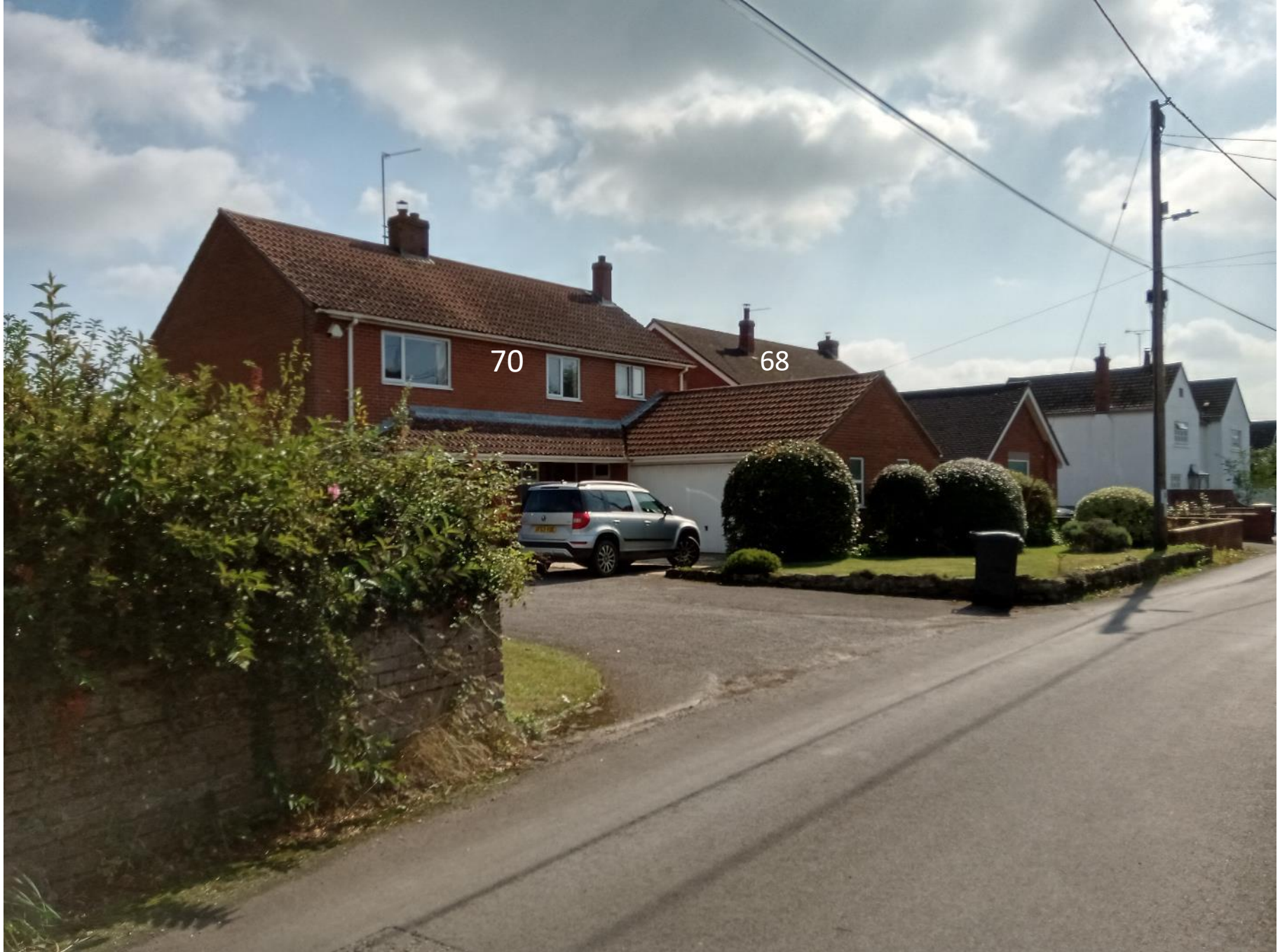
NEIGHBOURING PAIR OF PROPERTIES TO THE SOUTH – 70 & 68