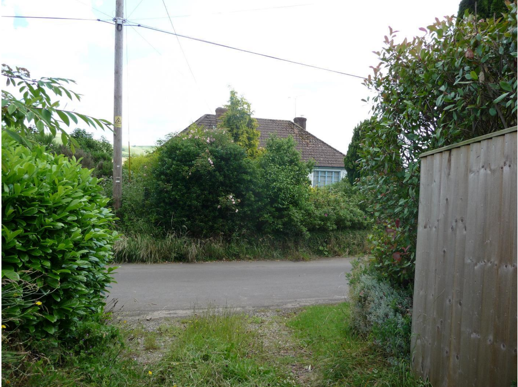
BUNGALOW VIEWED FROM THE OPPOSITE SIDE OF THE STREET