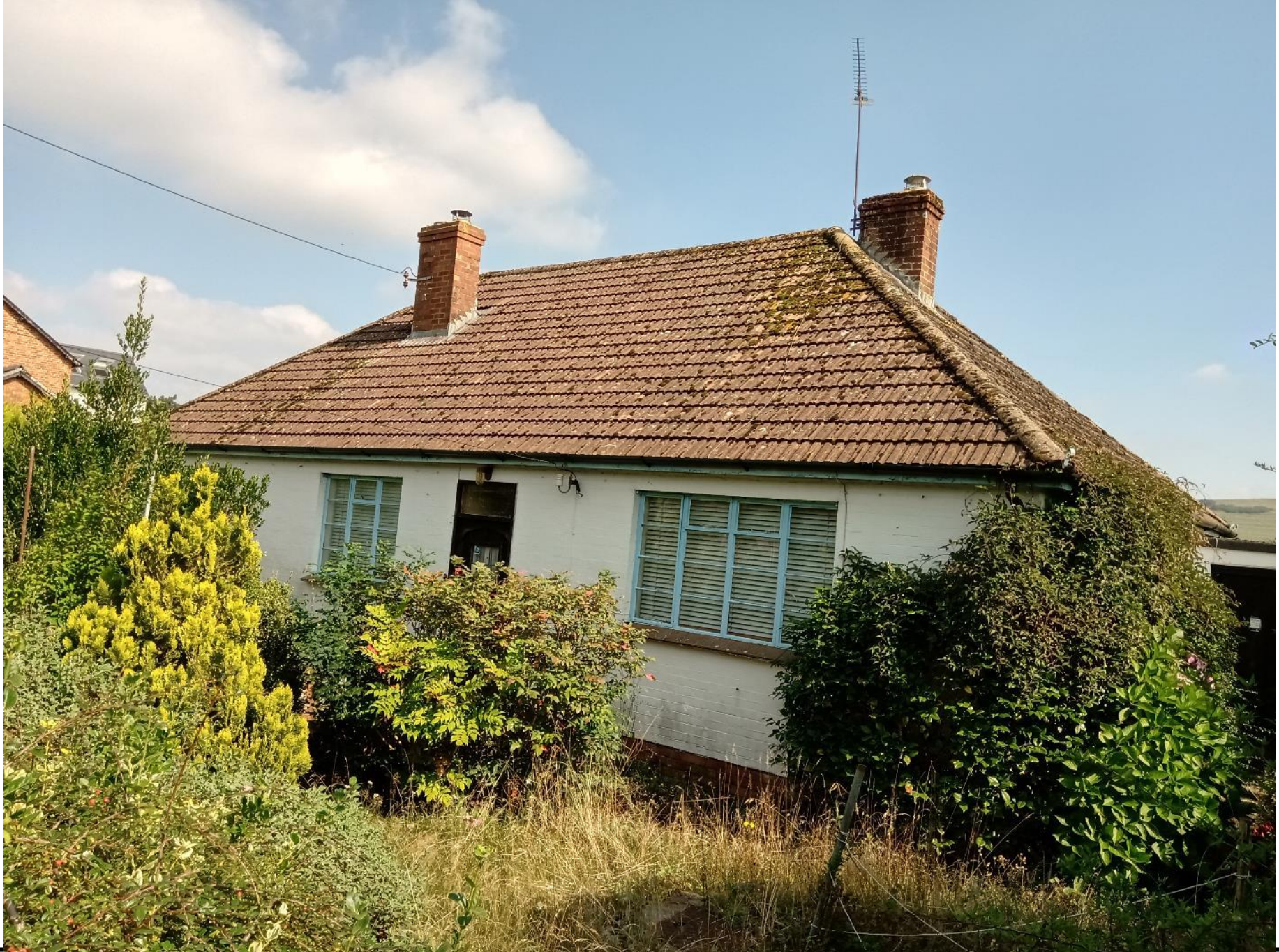
EXISTING BUNGALOW – FRONT ELEVATION