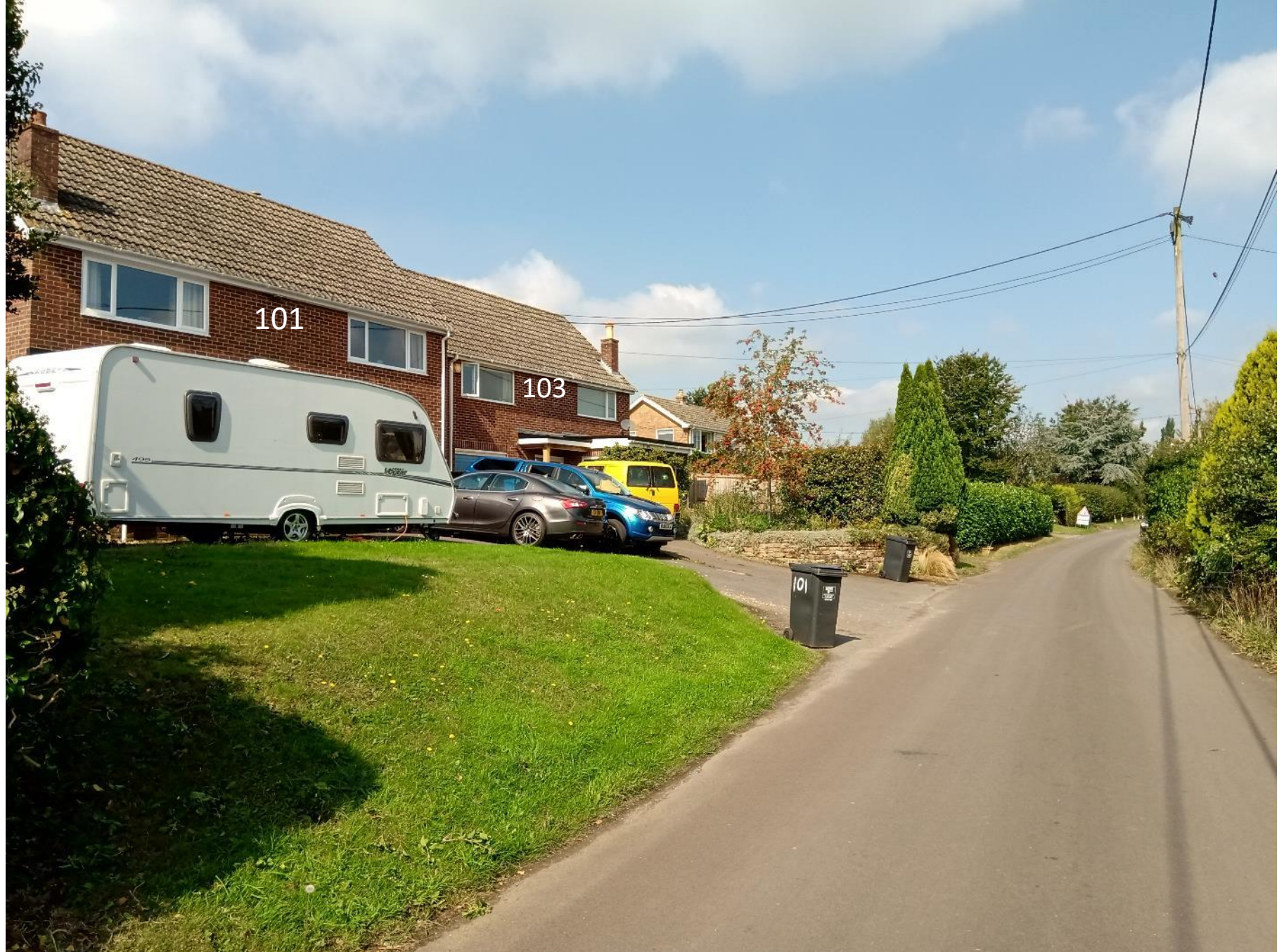
OPPOSITE PAIR OF PROPERTIES – 101 & 103